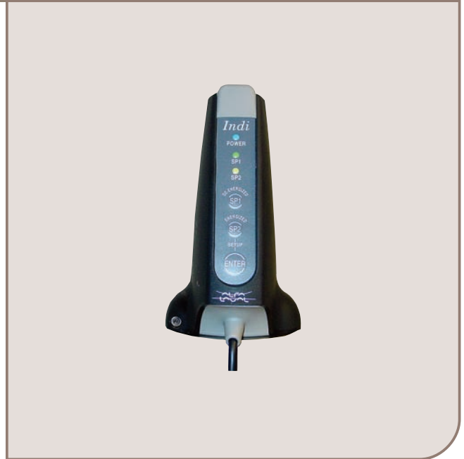
The indication unit IndiTop from Alfa Laval.